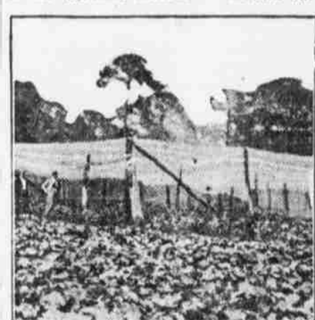
Big Cucumber Patch—Crop of Pickles Smaller in 1919 Than in 1918.

Of 509 pickle packers on the lists of the bureau of crop estimates, United States department of agriculture, 405 reported that they had contracted for and harvested 40,211 acres of cucumbers in 1919. This compares with 65,487 acres reported by 475 packers as having been contracted for and har-