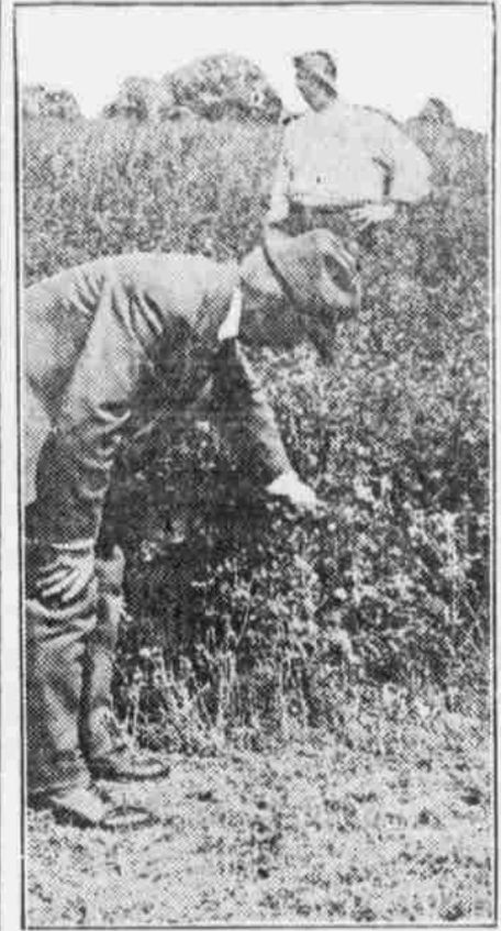
Splendid Field of Alfalfa.

Poor drainage is one cause for winter-killing. It is a common saying that alfalfa will not grow with "wet feet," and in land which is not well drained the crop will either drown out or heave out in the course of a few seasons. A deep loose seedbed is an unfavorable