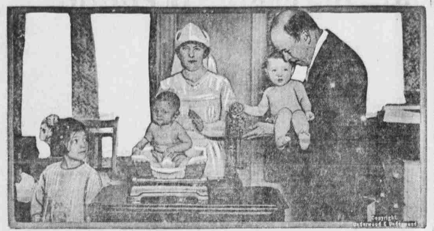
Mayor Peters of Boston weighing two of the perfect tots entered in a baby show recently held in that city.