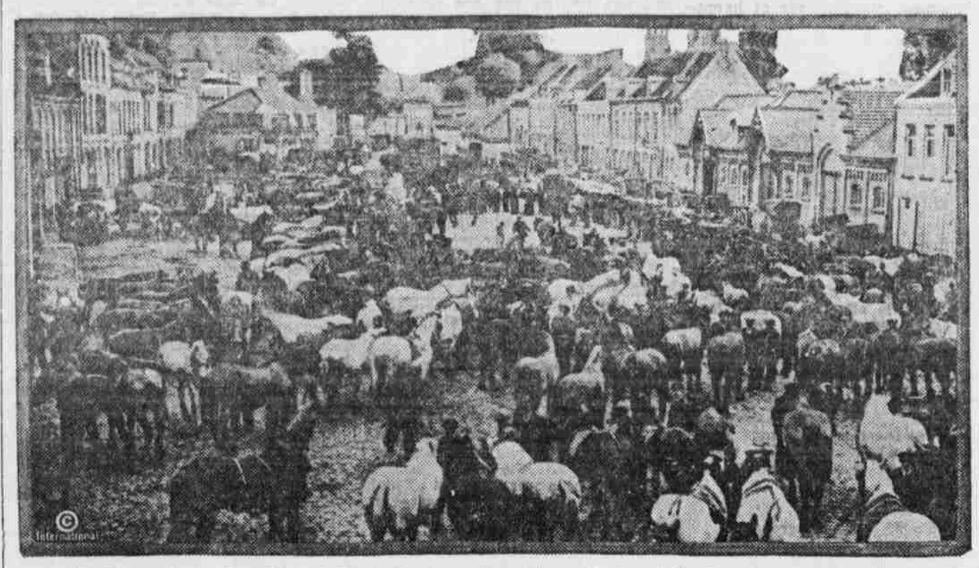
Big horse sale in the principal street of a town in southern France. The French government is now disosing of a great number of army horses, thus eliminating a big item of expense and at the same time providing the farmers with animals to aid in the reconstruction.