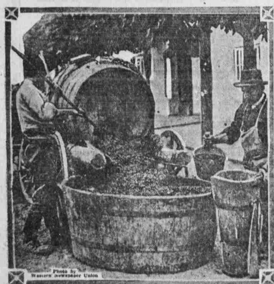
Such a thing as prohibition is quite unknown in Hungary, and one of the which industries in that country is the cultivation of the grape for wine. The photograph shows a grower selling grapes by the tubful to a merchant for from this philosophical husband and so the anadding.