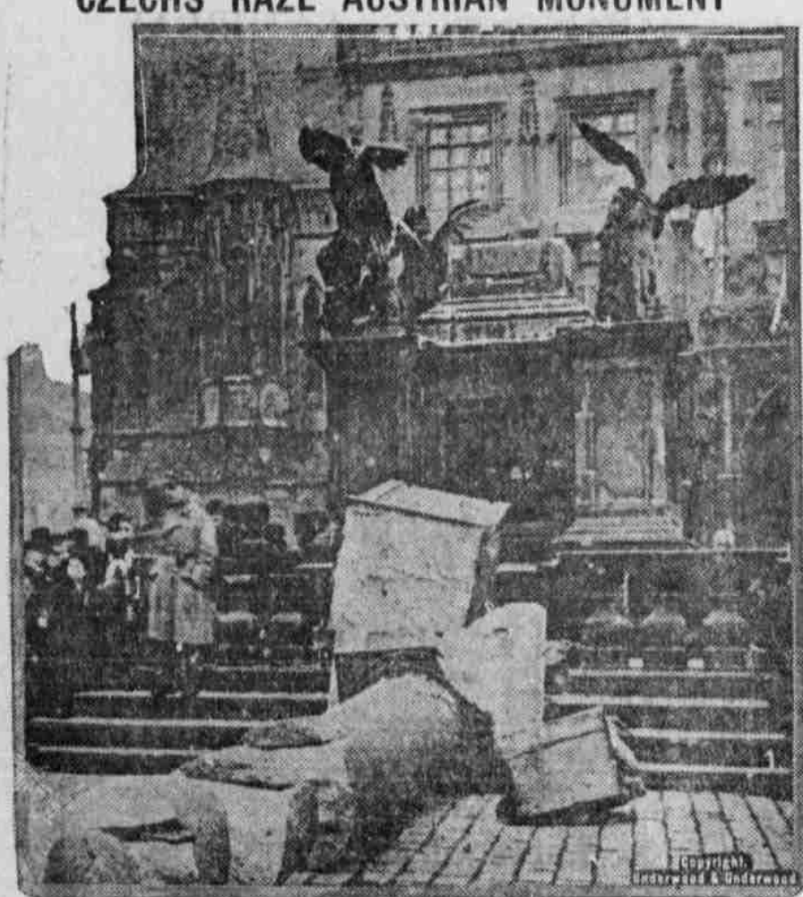
This photograph shows what happened to the monument which had been erected by Austria on the square where in 1620 many Bohemians were killed when the Czecho-Slovaks again became supreme in their country.