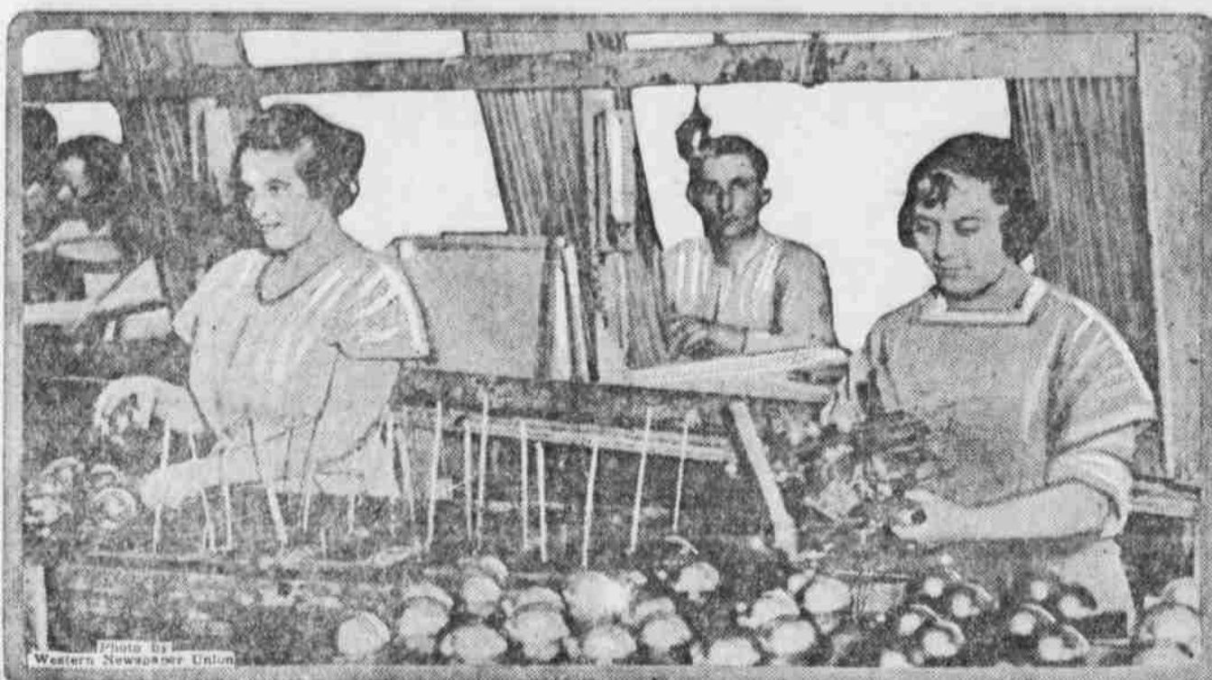
An interesting photograph showing American girls in an American factory making American Christmas tree ornaments from American material colored with American dyes. Experiments for the past three years have shown that the United States can make these trinkets as successfully as Germany.