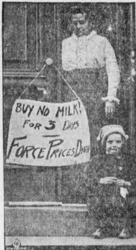
Five hundred thousand users of bottled milk in New York city, working in unison with the community councils of national defense, started a three-day boycott of milk. The idea was to voice a strong public protest against the prohibitive cost of the essential of life.