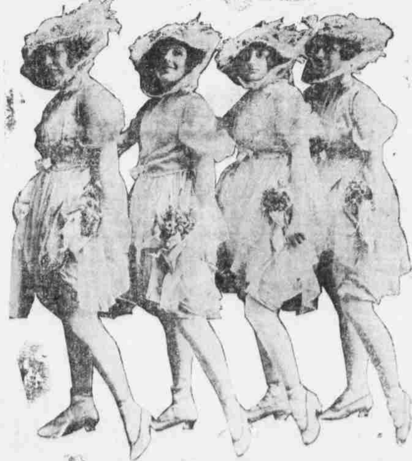
Singing girls in "Kiss Me Again" at the Keith Thanksgiving evening.