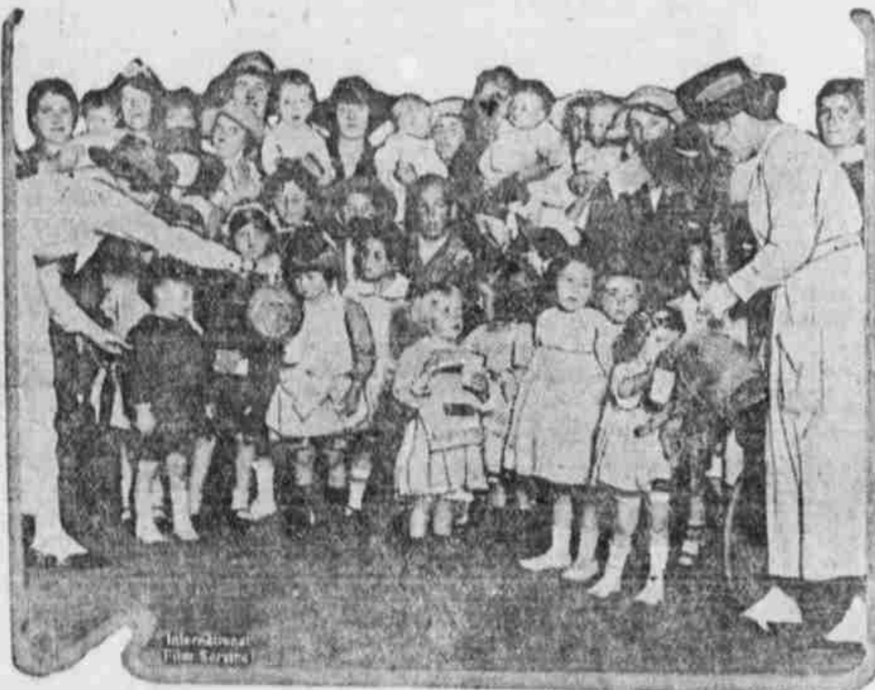
Several hundred wives and children of American boys who fought with the British army arrived in New York from England to make their homes with their husbands and fathers in this country.