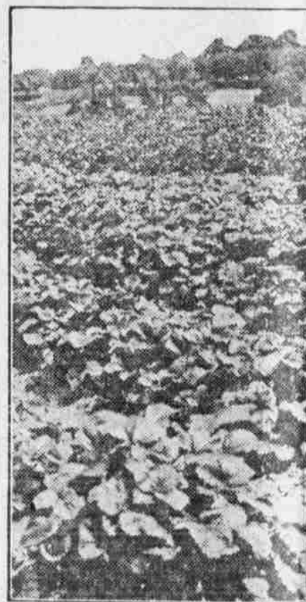
Excellent Field of Strawberries.

The manner of handling these plants, sometimes called "mother plants," is to set them in January, February, or March. They will start growing at once, and by June will develop enough runner plants to cover a considerably increased area. By August these runner plants are ready for setting in a more extended area, and by October or November they in turn