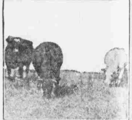
Cattle at Pasture on South Carolina Mountain.

Better stock and better crop yield is the motto of the county agent of Pairfield county, South Carolina. In carrying out this purpose he is waging empaigns for the importation into the county of more pure-bred bulls and for co-operative buying and hom