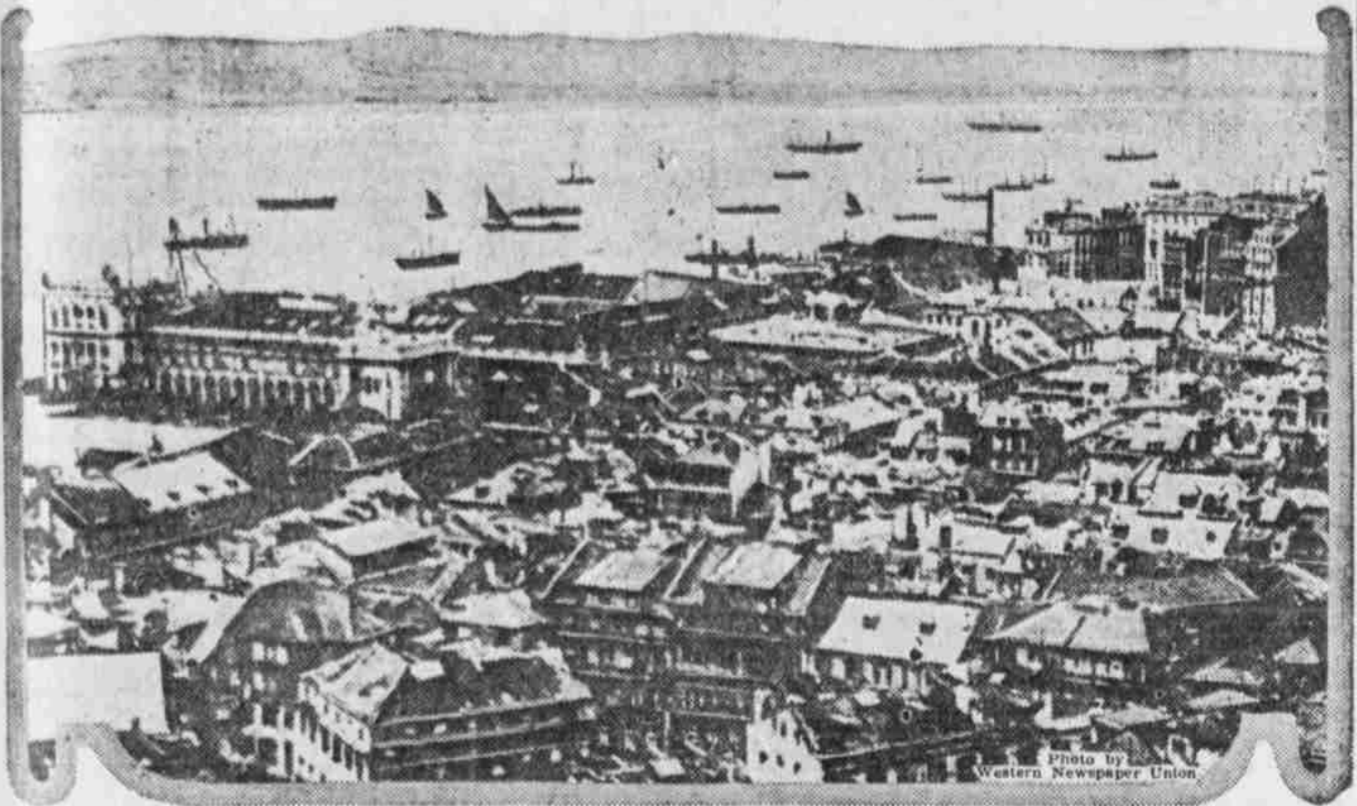
View of the harbor of Lisbon, Portugal, where the American navy plane NC-4 came down at the finish of her record-making flight across the Atlantic.