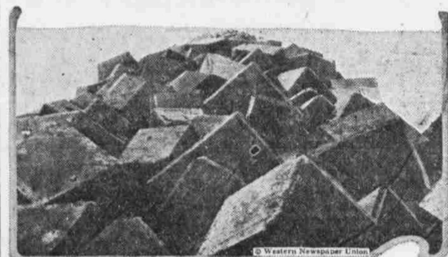
View of the massive breakwater or seawall at the Atlantic entrance to the Panama canal. Severe storms occasionally visit the isthmus during the season from November to April. This breakwater keeps the heavy seas out of Colon harbor and makes the Atlantic entrance safe for shipping. Each of these blocks weighs 15 tons.