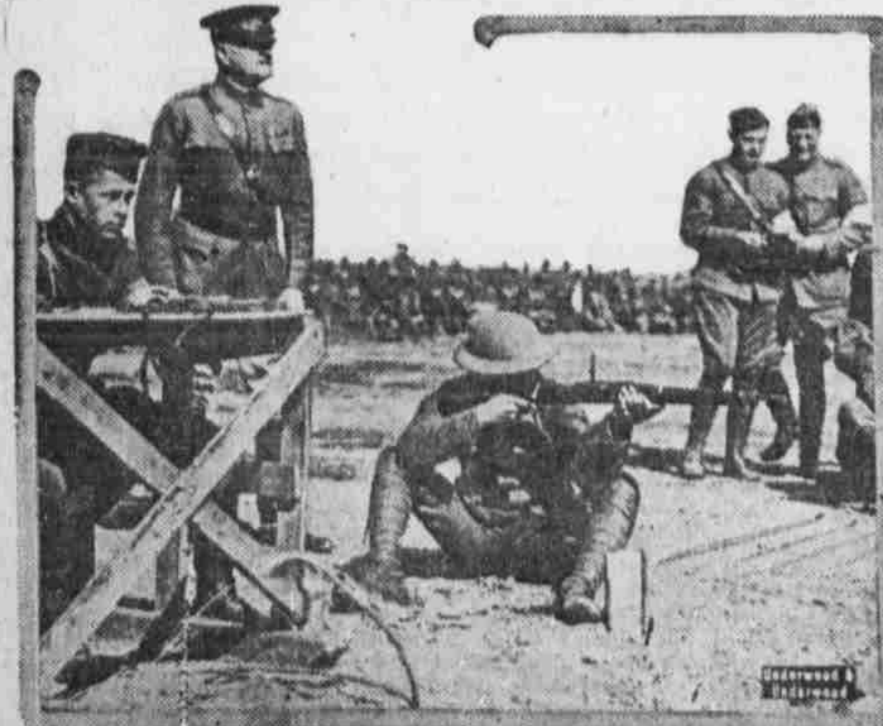
Gen. John J. Pershing was present at the opening of the great A. E. F. rifle match and musketry shoot at the D'Anvours range near Les Mans.