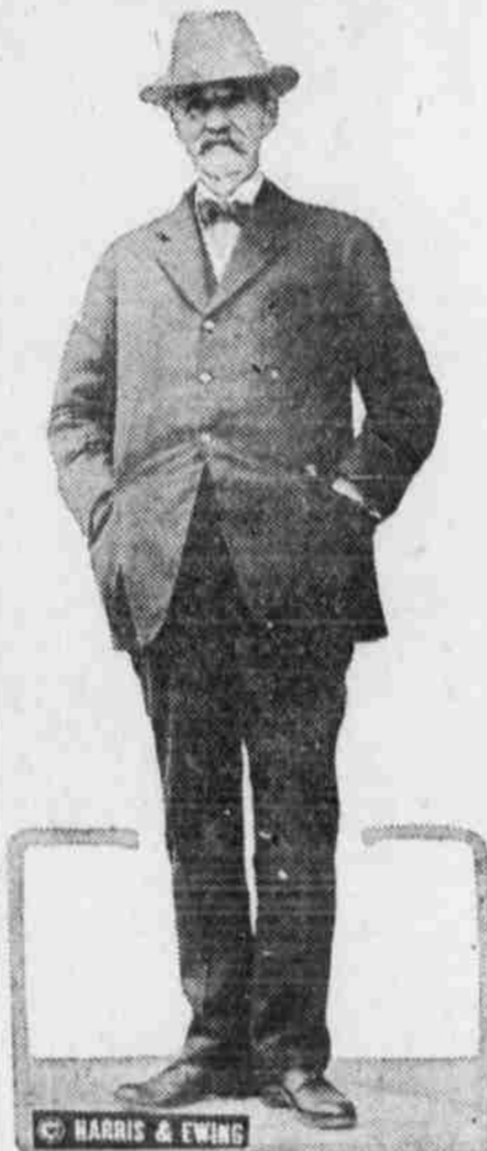
Senator Albert Baird Cummins of Iowa, who was made president pro tem of the senate by the unanimous vote of the Republican senators. He has been in the senate 11 years and is ranking member of the committee on interstate commerce, which will have charge of railroad legislation.