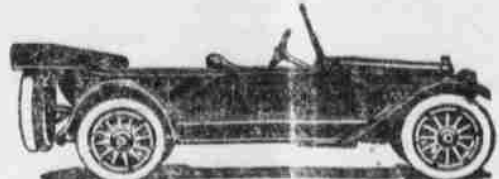
Model 45-A—8-Cylinder Pacemaker—a handsome car and a real performer

The One Great Light Weight Eight-Cylinder Car at a Moderate Price