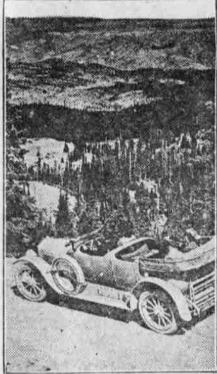
Good Road in One of Our National Forests.