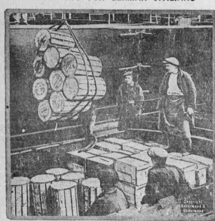
A British ship discharging food at Rotterdam into German boats for the German civilian population. The industrial centers where strikes are prevalent will get no relief until order is restored.