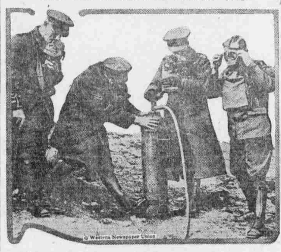
Polson gas is now being put to a good use in England. The gas is injected into rat holes by means of a rubber tube. Most of the rats are killed underground, but any which come out are dazed and easily struck down.