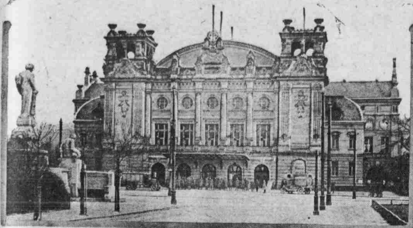
This famous Fest Halle of Coblenz has become the Y. M. C. A. hut of headquarters and in it are cared for the 8,000 men who come in daily on leave and those stationed in the city who have time on their hands.