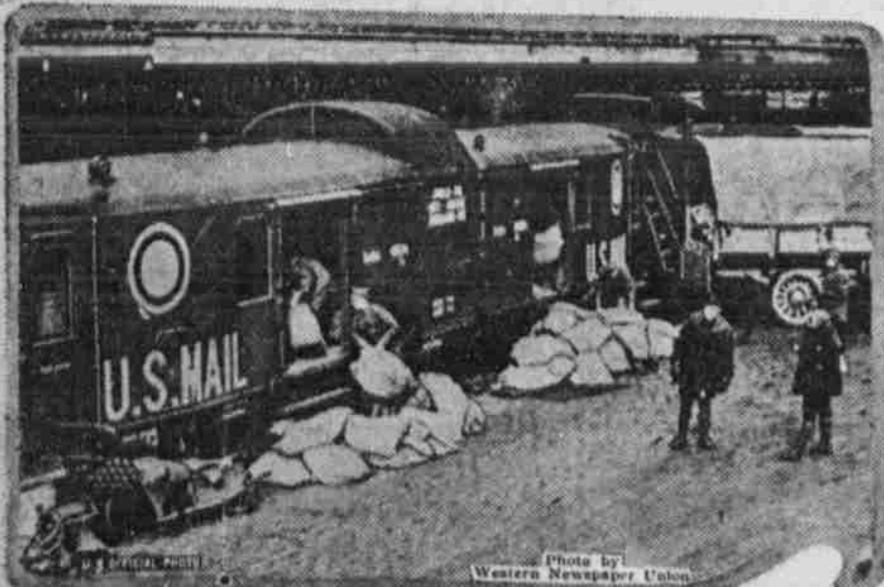
This mail car, a trophy of war, surrendered by the Germans to the Americans, is now in the service between Paris and Coblenz, carrying correspondence for the Yanks of the American army of occupation in Germany.