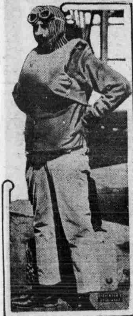
Lieutenant Commander Patrick N. L. Bellinger of the air station of the naval operating base at Hampton Roads and the Fifth naval district, may pilot the first United States naval seaplane in an effort to cross the Atlantic.