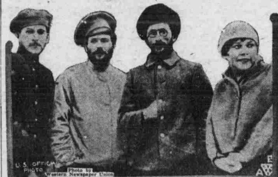
These bolshevik leaders were arrested at Ekaterinburg, Russia, by the Czechs, and 24 hours after the picture was taken they were executed. Left to right they are the bolshevik secretary, the town commissaire, the chief justice and a girl stenographer.