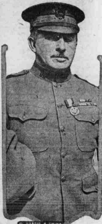
Maj. Gen. Leonard Wood photographed in Washington just after he had been decorated with the Distinguished Service Medal.