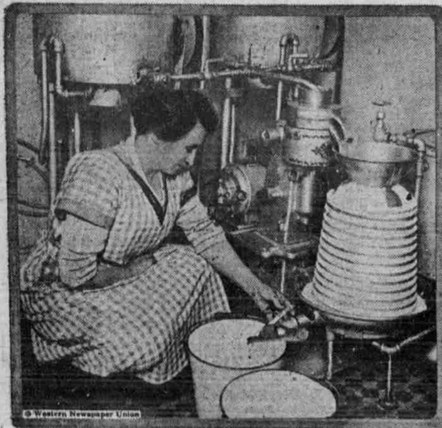
To fight the high cost of milk, the department of markets of New York, through an invention, is producing "Grade A" milk at ten cents a quart. There is little difference in the taste of the real milk and this milk and the food value is the same. It is made up of powdered milk, water and sweet butter.