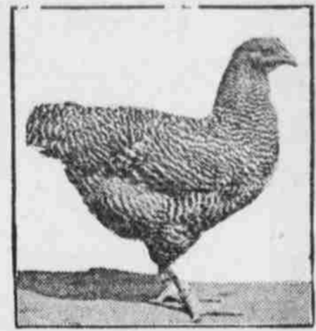
A Good Type to Select for Laying.

The kind of care and attention given a setting hen during the process of hatching eggs plays an important part on the number and condition of the chicks when hatched. See that the hens are made comfortable on the nest, allow them to come off only once a day to receive feed and water. If there are any that do not desire to come off themselves, they should be taken off. Hens usually return to