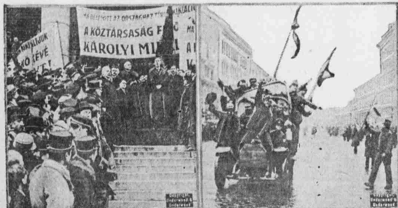
These photographs of the recent revolution in Hungary which resulted in the proclamation of a republic, with Count Karolyi as president, show an automobile loaded with revolutionists dashing through the streets of Budapest and Count Karolyi and Johan Hock addressing a crowd in front of the parliament building.