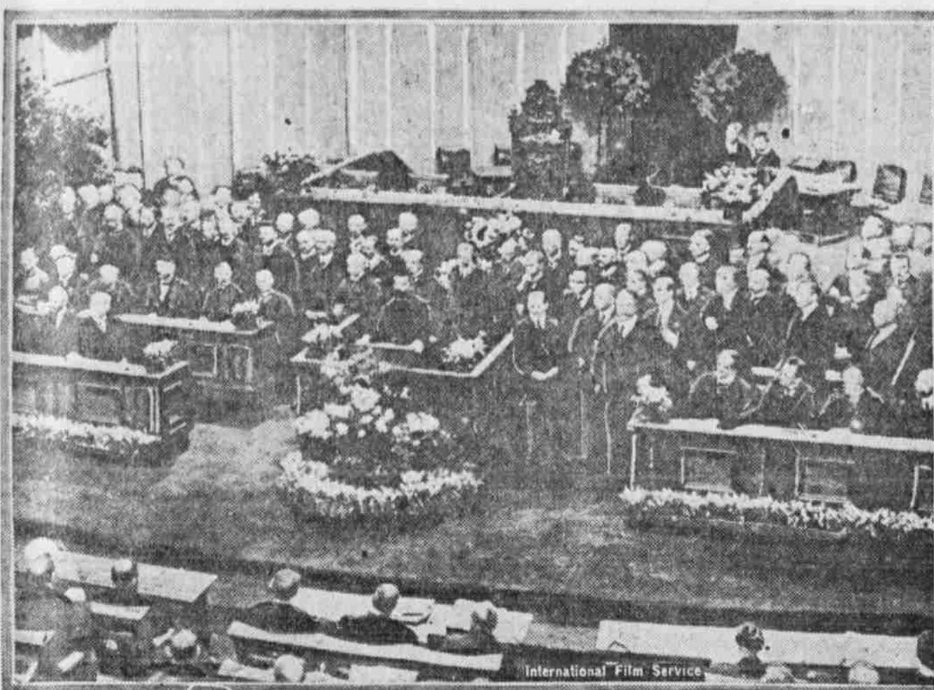
This is the first photograph to arrive in this country showing the national constituent assembly in session in the theater at Weimar, Germany. Friedrich Ebert, newly elected president of the German republic, is shown delivering his address.