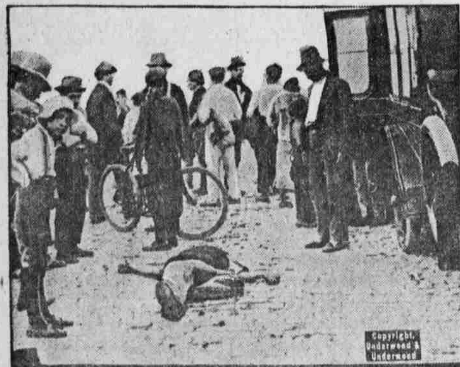
This photograph, taken during the strike started in the Argentine by the anarchists, shows a scene in front of the Vasena iron works just after a fight between the strikers and firemen. The body of one of the killed lies in the street.