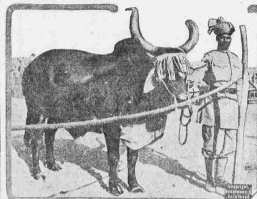
This bullock saved a big gun from the Turks in the British campaign on the Tigris. For this the British government has allotted it a pension of two cents per day for life.