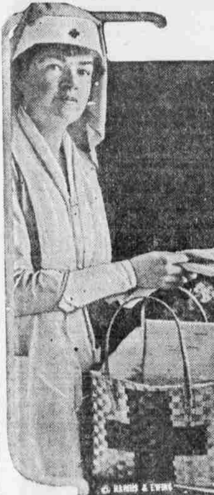
Mrs. John Jacob Rogers, wife of Congressman Rogers of Massachusetts, is said to be the most popular ward visitor at Walter Reed hospital, Washington. She has been serving wounded soldiers since the first one came from the other side.