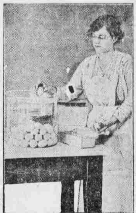
Preserving Eggs in Waterglass.

Spring is the season when there is a surplus of eggs on most farms. For this reason it is desirable that a supply be preserved at home to be used next fall and winter when eggs are hard to get and are high in price. There are several methods of preserving eggs which have proven very successful and which, because they are cheap, simple, and effective, should be put into practice more extensively. Eggs to be preserved must be fresh, and should be placed in the preserving container as soon as possible after they are laid. One of the best methods of preserving is by the use of waterglass, a pale yellow odorless, syrupy liquid that can be bought by the quart or gallon from the druggist or poultry supply man. It should be diluted in the proportion of 1 part of waterglass to 9 parts of water which has been boiled and allowed to cool. Earthenware crocks or jars are the best containers, since their glazed surface pre-