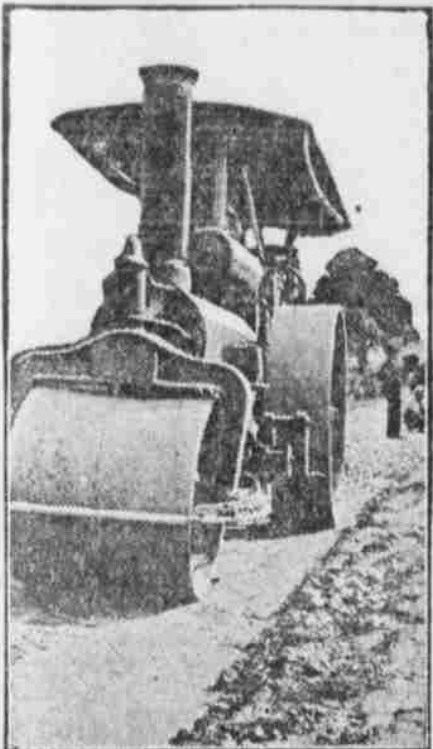
Road Roller Doing Repair Work.

(Prepared by the United States Department of Agriculture.) The weather bureau of the United States department of agriculture has arranged, in co-operation with the state highway commission of Pennsylvania, to aid the automobile and motortruck traffic during the winter over the Lincoln highway between Pittsburgh and Harrisburg by giving out daily information of the weather conditions prevailing over the route and issuing weather forecasts and warnings of heavy snows and cold waves for the region traversed. The plan is for the assistant superintendents of highways at points along the route to report to the weather bureau office at Pittsburgh at eight o'clock each morning by telephone or telegraph the depth of snow or ice on the highway, giving its general condition. These reports