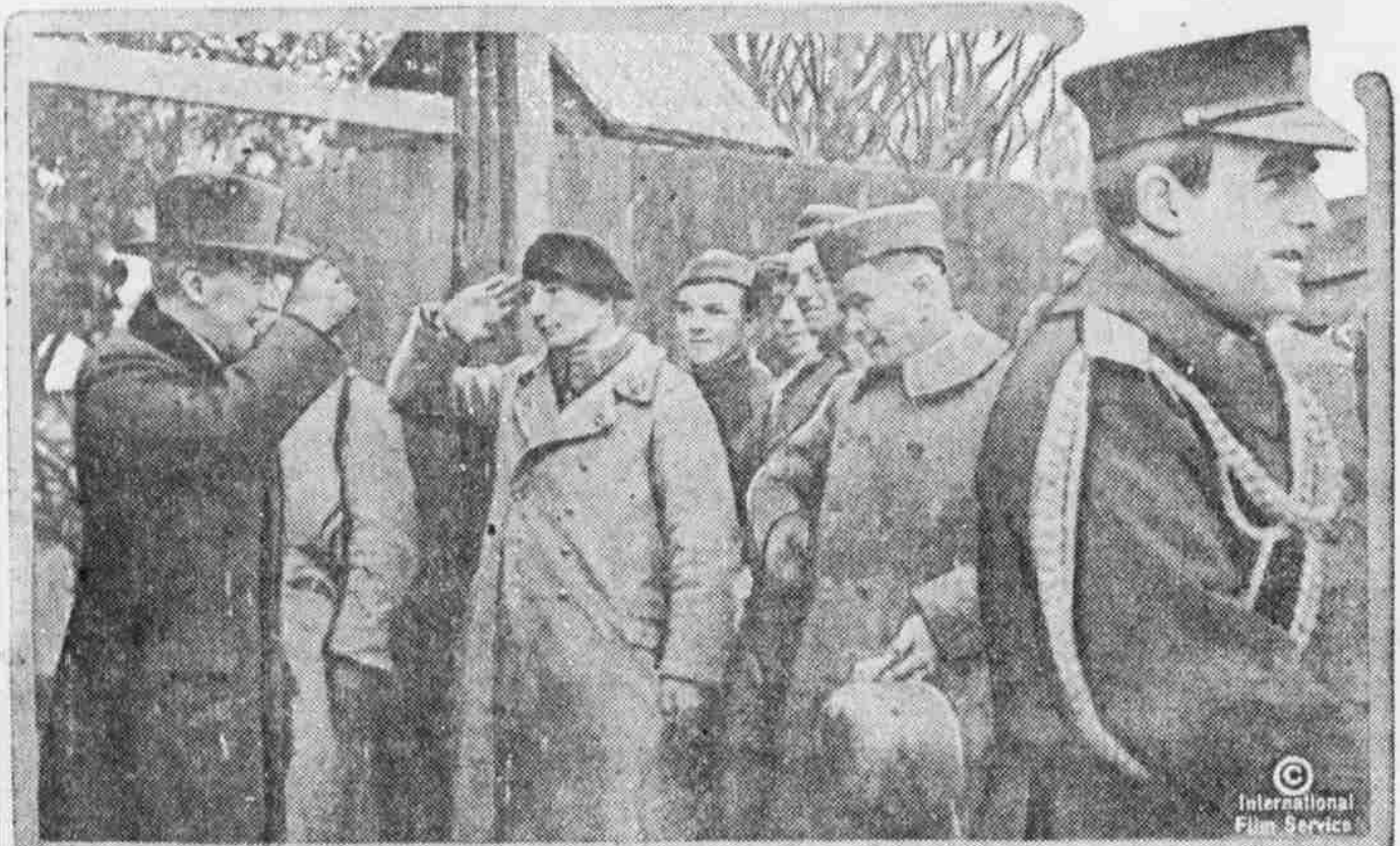
President Wilson saluting the veterans at Chateau Thierry as he was leaving the station at the time of his recent visit to the scene of the great American victory.