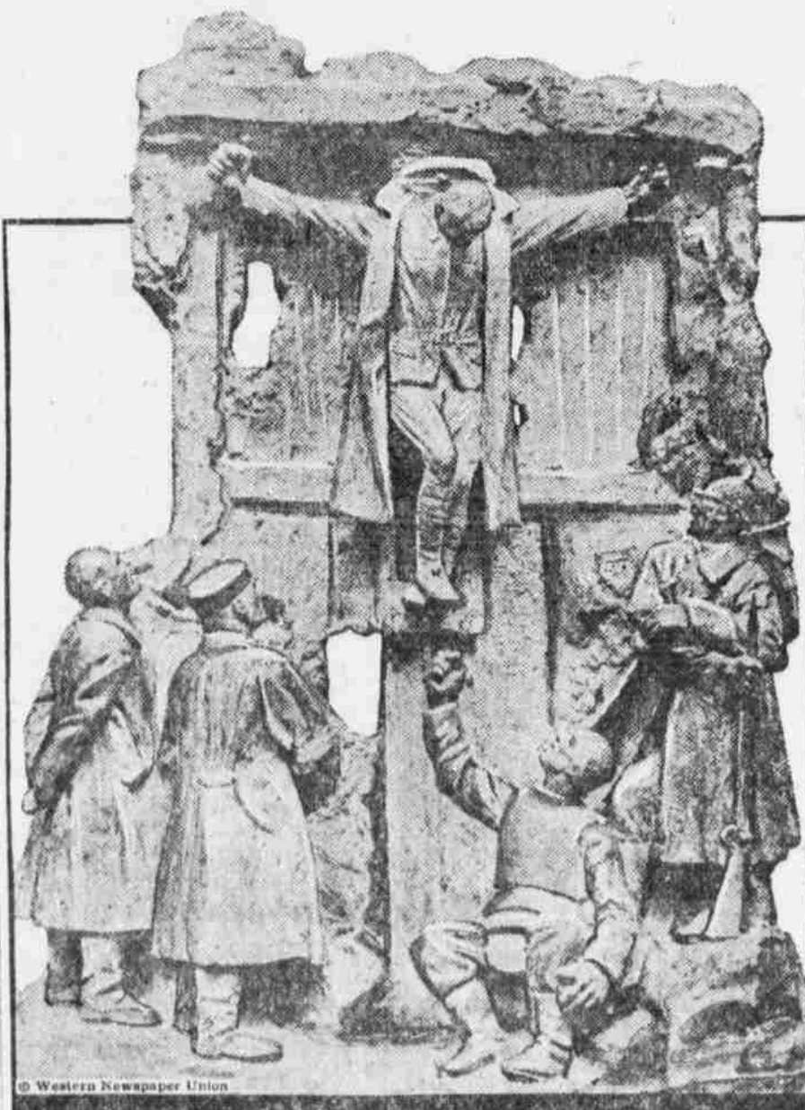
This piece of bronze sculpture, representing the crucifixion of a Canadian soldier by the Germans, was a feature of the Canadian memorial war exhibition held in Burlington house, London.