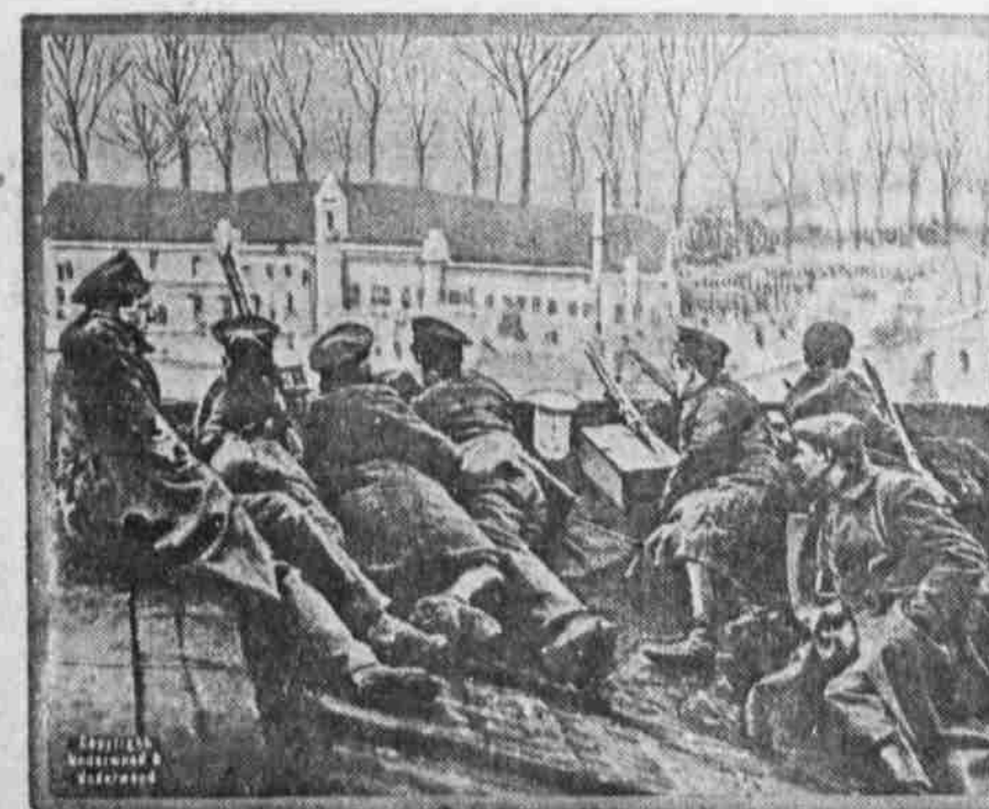
German government troops stationed upon the roof of a shack, armed with light machine guns, are shown protecting a government building in Berlin against the Spartans.