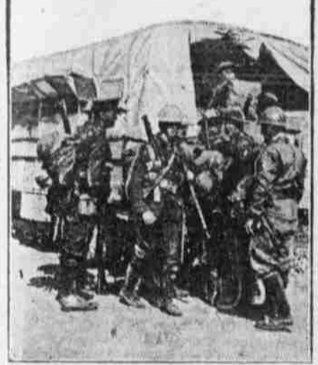
Troops Being Transported in France.

"I have seen movements of troops made in the dark which would have been impossible in any other country