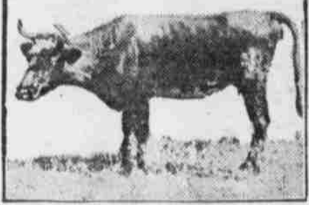
Animal Badly Infested With Ticks.

Another record, too, was broken this year. The number of cattle dippings in all tick-infested territory in the first