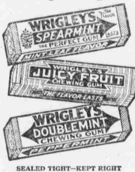
SEALED TIGHT—KEPT RIGHT

in the pink sealed wrapper and take your choice of flavor. Three kinds to suit all tastes.