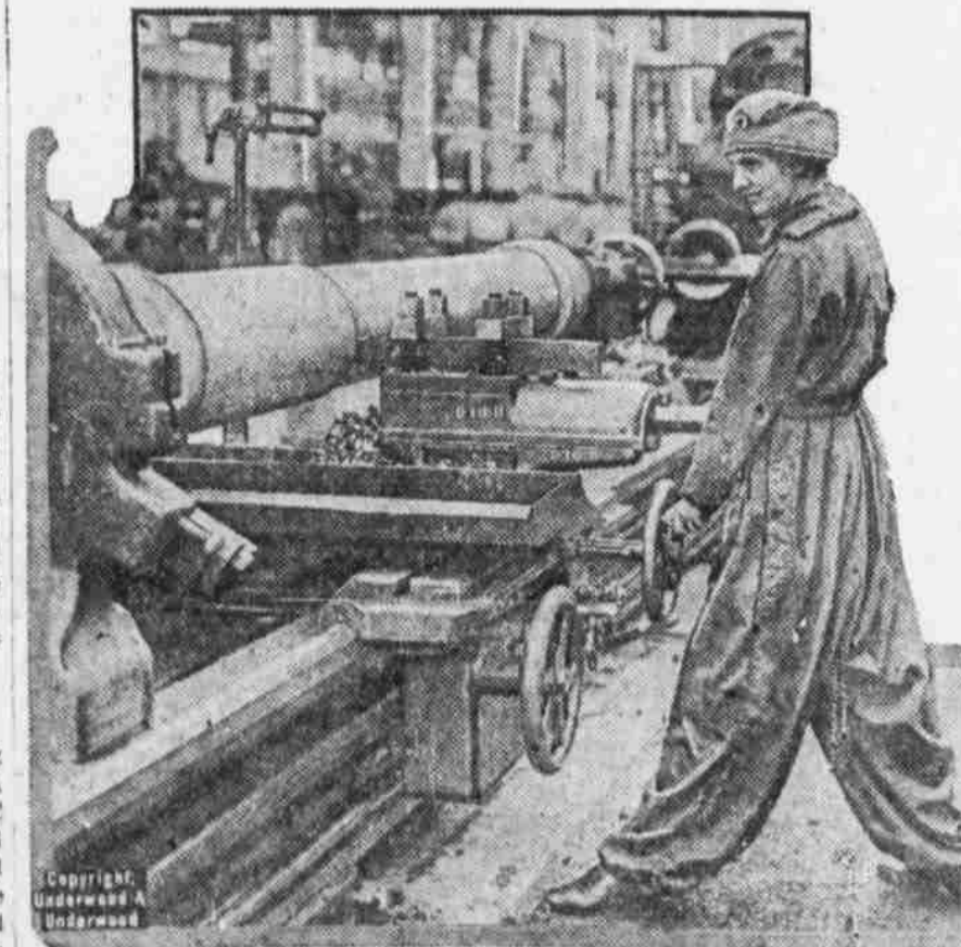
The first photograph taken of women workers in a United States government arsenal is shown here. The important work of turning out the big guns has been taken up by women in a huge government arsenal in New England.