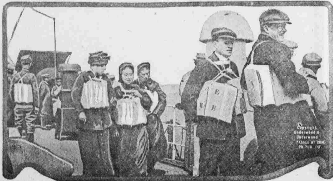
This scene on the deck of an Atlantic liner shows the passengers all wearing their life belts, a habit that will be discontinued now.