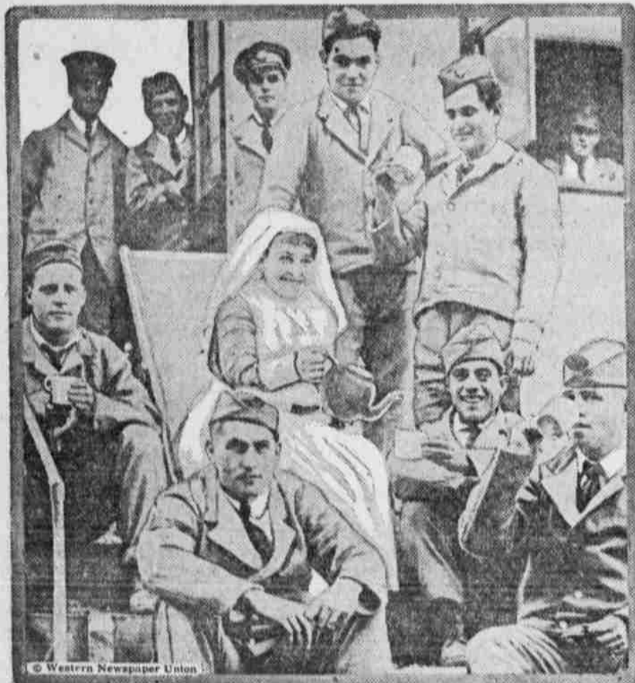
A number of Americans are shown here having the proverbial English tea at a hospital in England. These men were in the trenches a week previous to the taking of this picture.