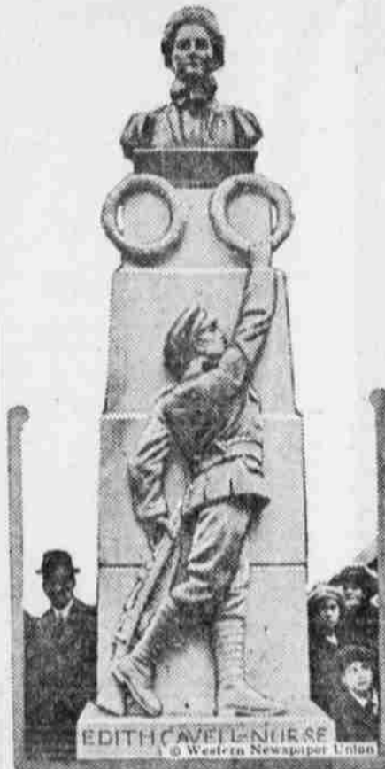
This memorial statue has been erected to the memory of Edith Cavell, who lived a patriot and died a martyr. The memorial was unveiled by Queen Alexandra at Norwich, where her majesty opened a home for the district nurses. This home was named the Nurse Cavell Memorial home.