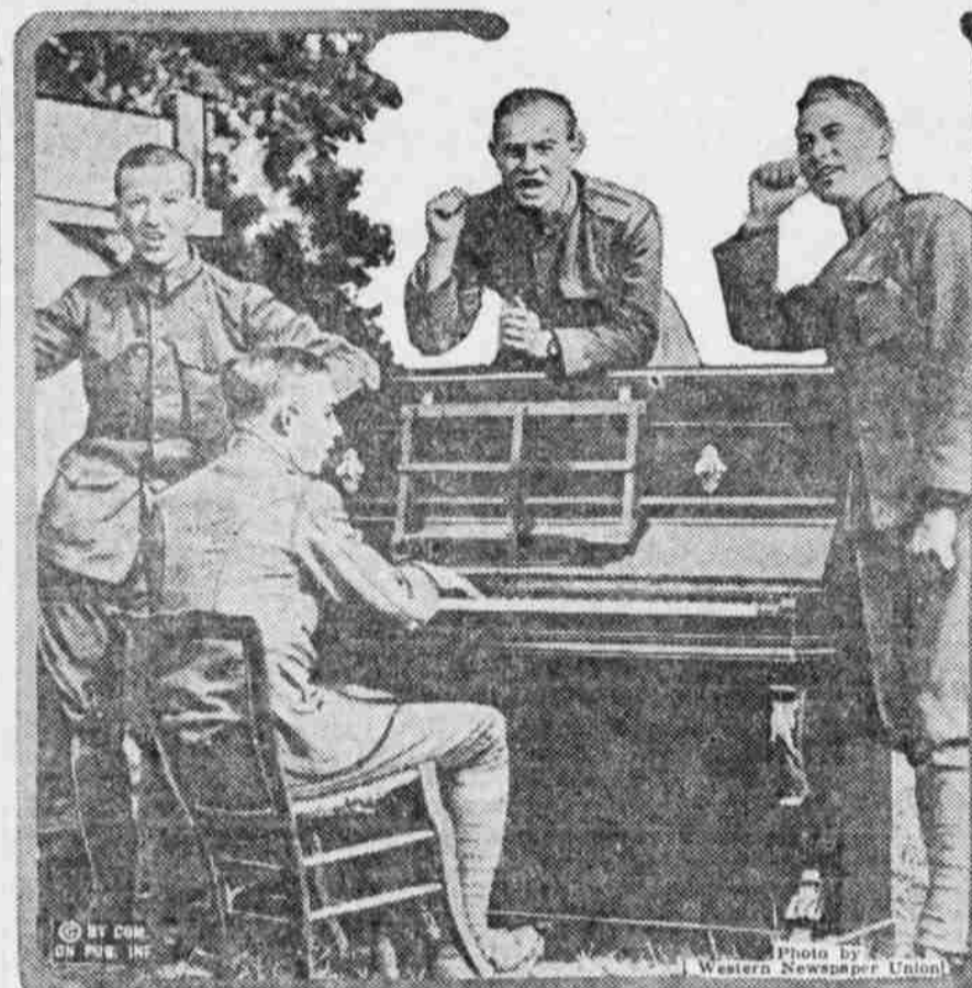
These Yanks, who used to live in and around a well-known north Atlantic port, put on a Broadway musical show back of the lines in France for the entertainment of their comrades.