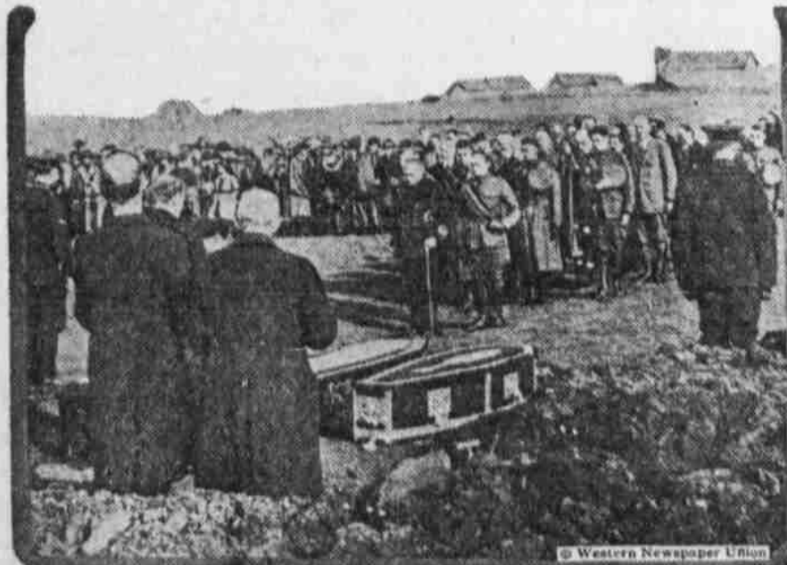
The impressive burial service, that took place in Scotland, near the scene of the disaster, of the men who perished in the collision of the British transport Kashmir and the American troop ship Otranto between Scotland and Ireland in the North channel.