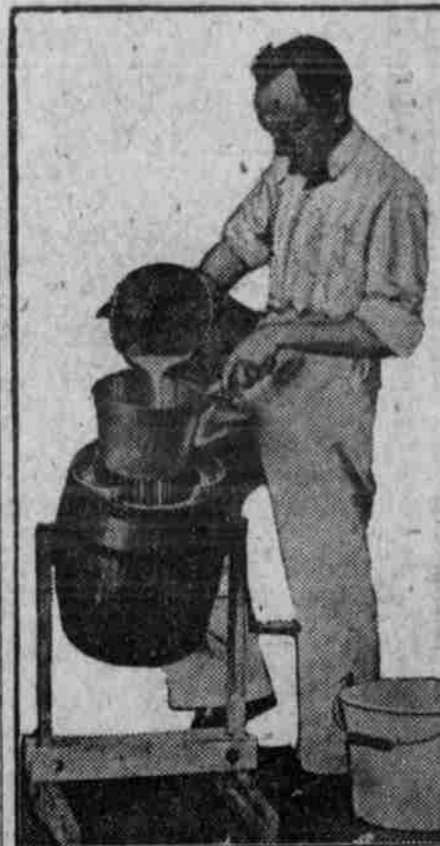
Straining Cream into Churn.

Cream should be poured into the churn through a strainer to break up possible lumps and to remove curd