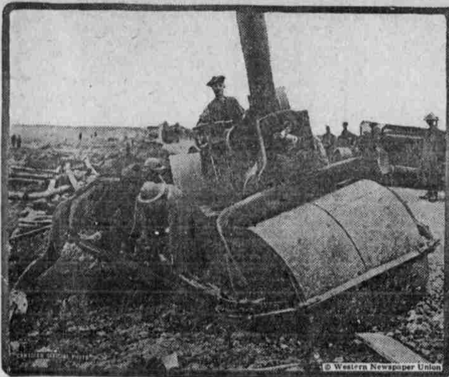
The engineers across the water are constantly busy making roads and reconstructing those that have been torn up by shells. Here is a roller that has got stuck in a ditch, and it takes husky Canadians like those you see to pry it back into place.