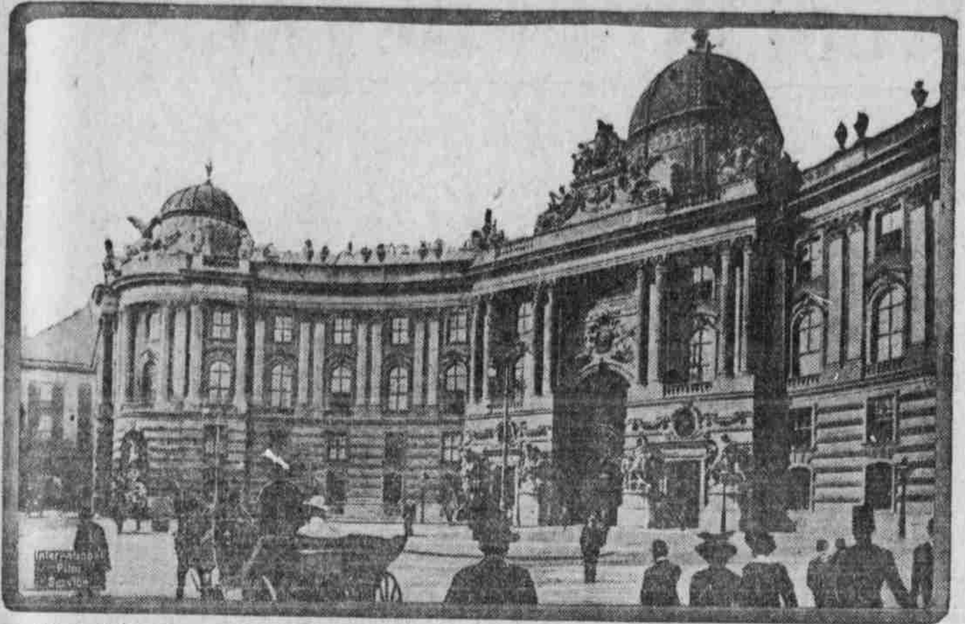
This is the facade of the Hofburg palace in Vienna, one of the residences of Emperor Charles, which was stoned by a hungry mob not long ago.