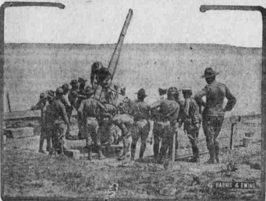
An anti-aircraft gun of the type which protects many of our coast defenses.