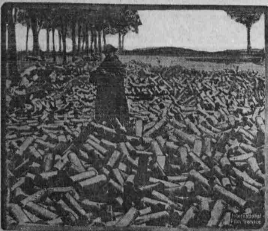
This heap of empty shell cases shows just a part of the ammunition expended by one British battery in a few days' fighting on the French front. "We never have more shells than they need, for all their ammunition factories are working night and day."