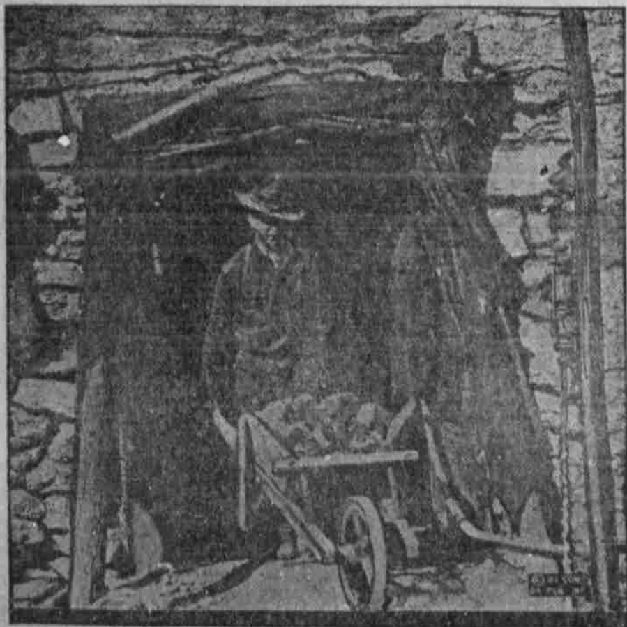
American engineers are doing splendid work in extending and perfecting the trench system in the American sector in France. Demolished walls and ruined buildings are considered especially valuable for the establishment of intermediate depots and posts. This American engineer is converting a tunnel into a post command by the quick methods known to army constructors.