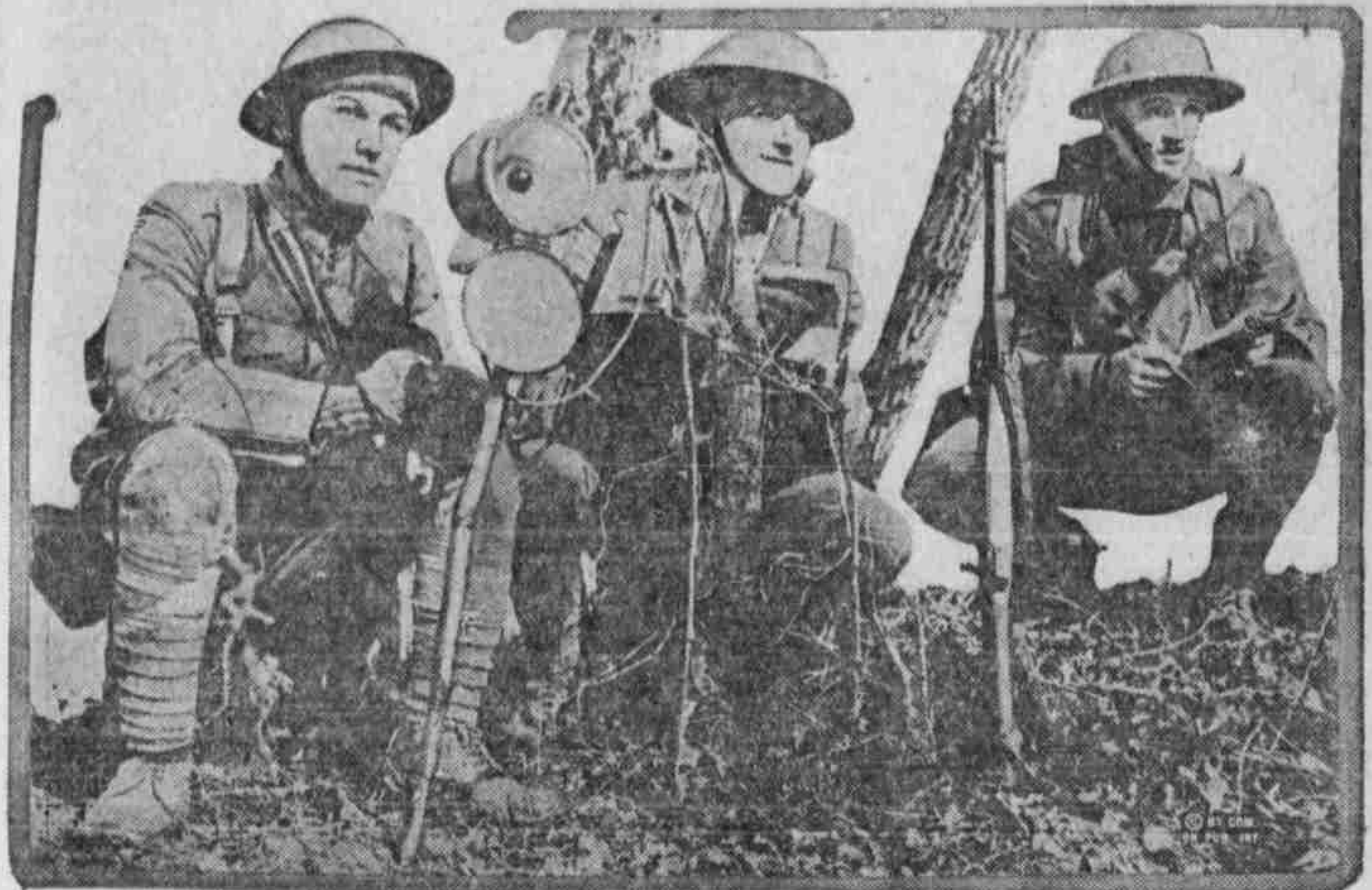
Members of the United States Marine corps in France sending messages to comrades.