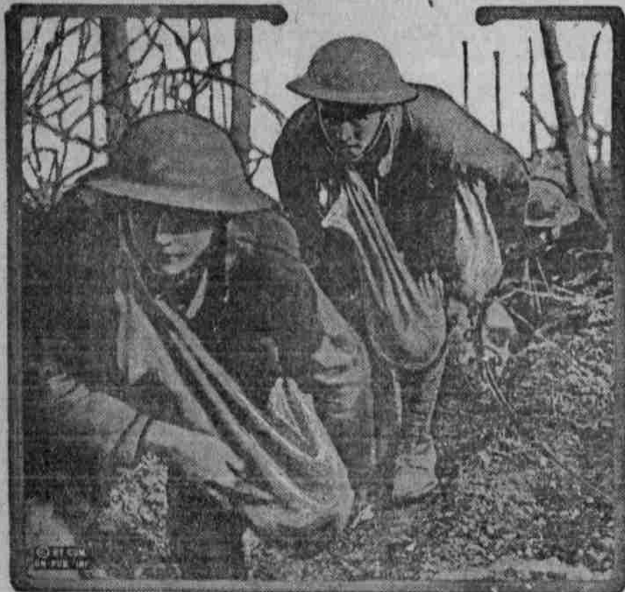
Frenchmen and Americans are advancing across No Man's Land, somewhere on the front in France. They are moving cautiously, ready to use the grenades they are carrying in the sacks slung over their shoulders.