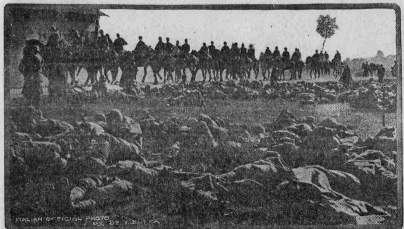
Tired from the strenuousness of the battle, these Italian infantrymen threw themselves on the ground, wrapped themselves in blankets and overcoats and fell asleep immediately. While these men are resting the cavalymen come up from behind and still keep moving on. The photograph presents a most unusual sight.