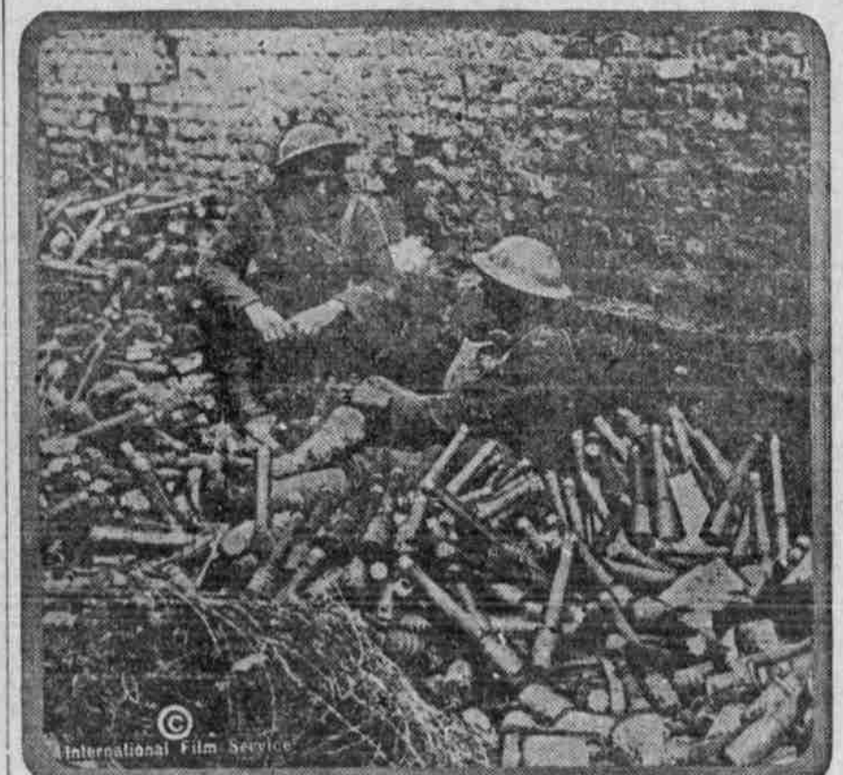
British Tommies take possession of a German hand grenade dump after a counter-attack in Picardy. They are shown resting at ease among the death-dealing bombs.