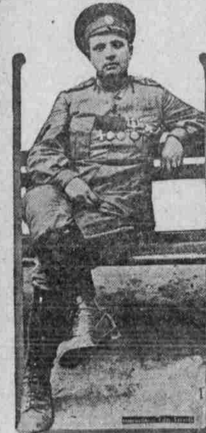
Mme. Leonina Botchkareva, founder and leader of the famous Russian women's Battalion of Death, who arrived at a Pacific port en route to France, where she will offer her services to the allies. At the time of the downfall of Kerensky Mme. Botchkareva was smuggled out of Moscow and taken to Vladivostok, where she took refuge on a British war vessel.