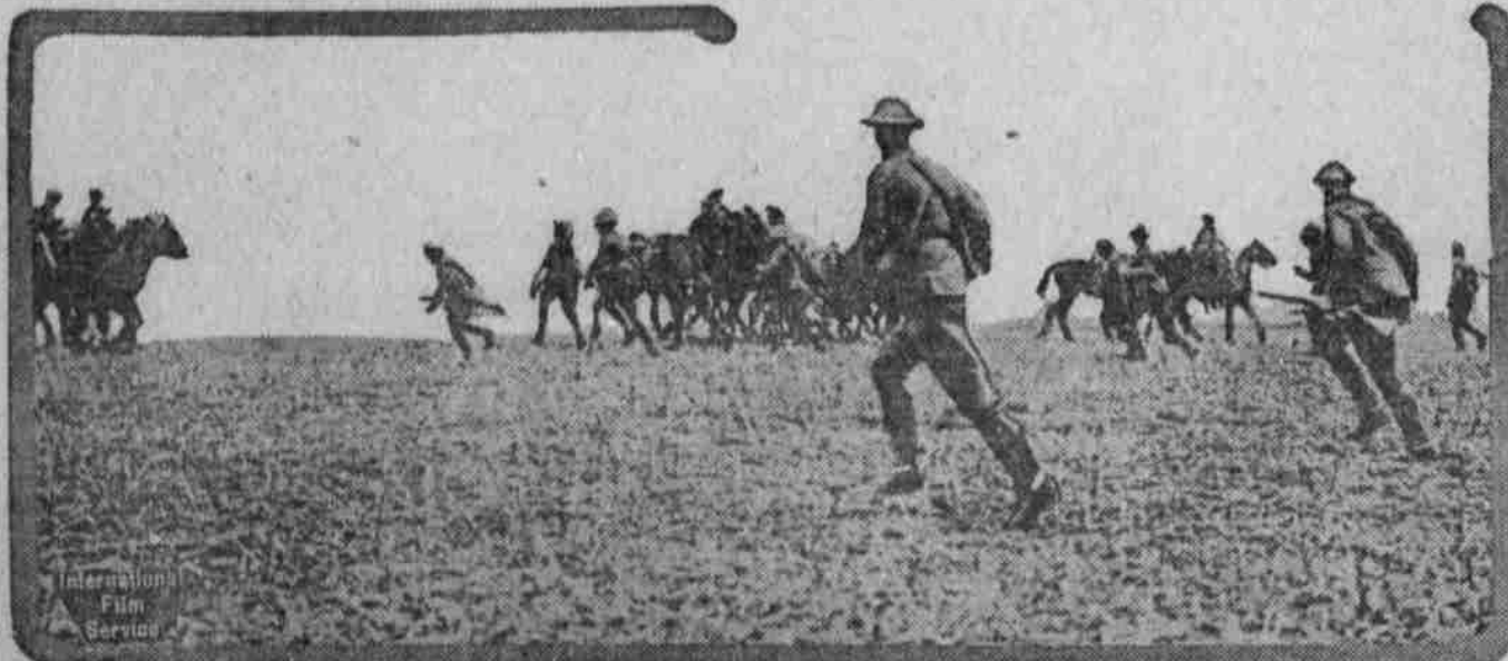
British cavalry has played a big part in stopping the rush of the Huns in Picardy. This photograph shows a party of cavalymen dismounting and going to the aid of a hard-pressed infantry regiment.