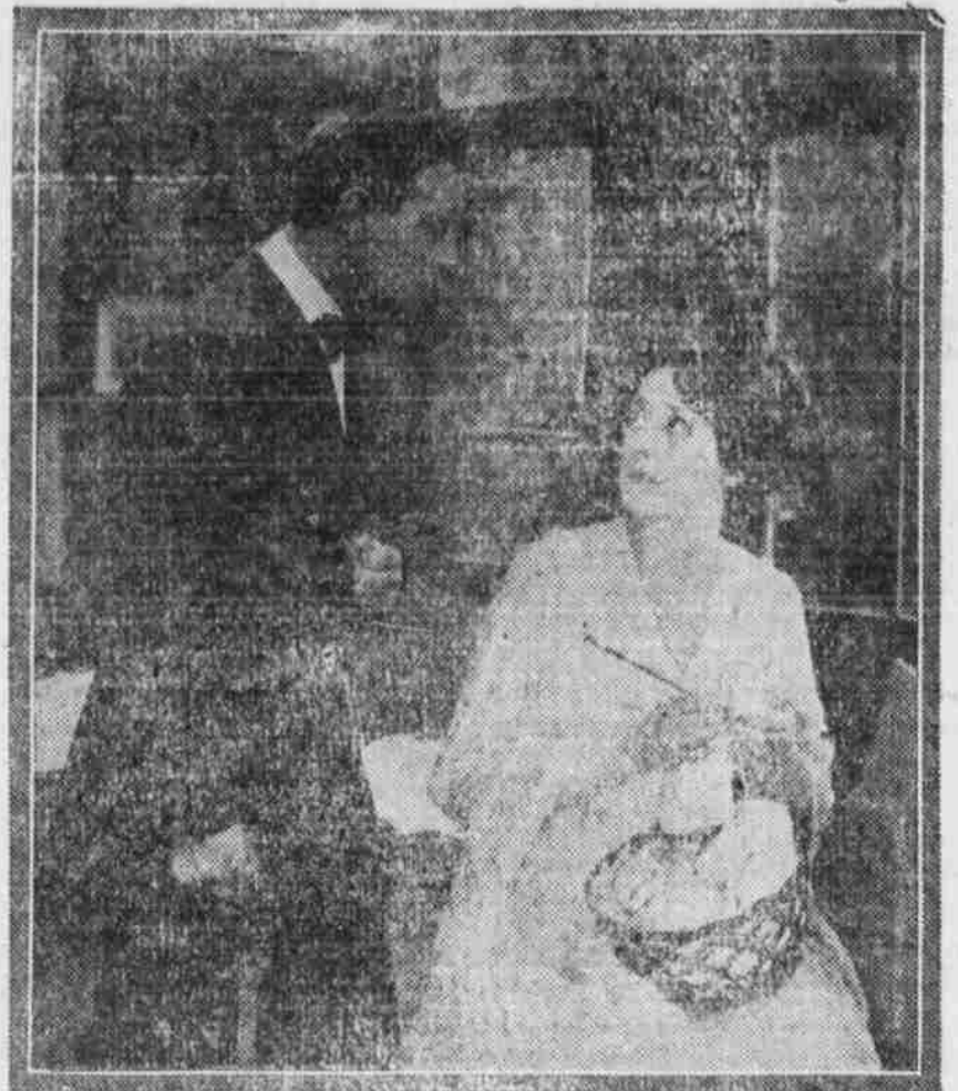
CLARA KIMBALL YOUNG IN "THE FOOLISH VIRGIN" STANDARD PICTURES

Wanted—A Home. I have buyers for two 5 or 6 room cottages close in. O. H. THOELECKE.