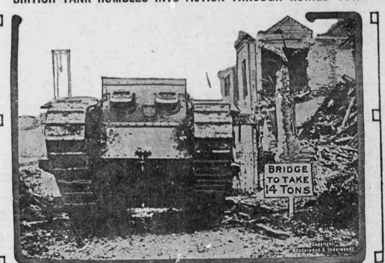
Rumbling and roaring as only a tank can, this British monster is waking the echoes amongst the solitude and deselation that once was a town. The tank is on its way to the front to help beat back the Teuton and prevent him from leaving any more mementos, like this, of his work in France.