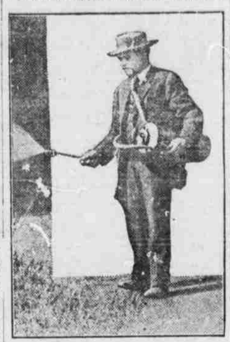
Applying Germ-Killing Solution.

including ceilings, side walls, stall par- air, in themselves among the most powerful disinfectants known. Most disease germs thrive in dampness, dirt, Remove all accumulations of fifth by and darkness, and a clean, dry stable scraping, and if any woodwork has presents the most unfavorable condibecome decayed so that it is porous tions for their development. For this reason good drainage is also essenburned and replaced with new mate- tial in the stable and about the barn