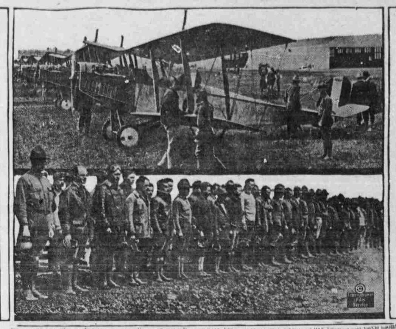
Above are the airplanes lined up ready for flights, and below are the student aviators ready for inspection.