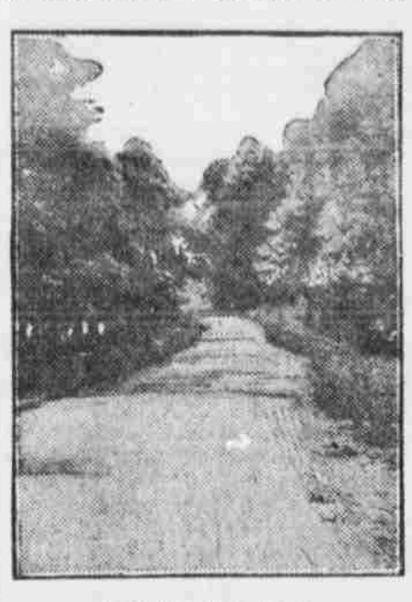
Good Road in Iowa.

The automobile is becoming a very Important factor in the movement for better roads. Every auto owner, be he farmer or city man, is a booster for better roads, but the city man is probably more impatient with our present roads than the farmer. In our political life the farmer has always been the conservative while the city man has been the radical, the progressive. It takes the two factions to bring