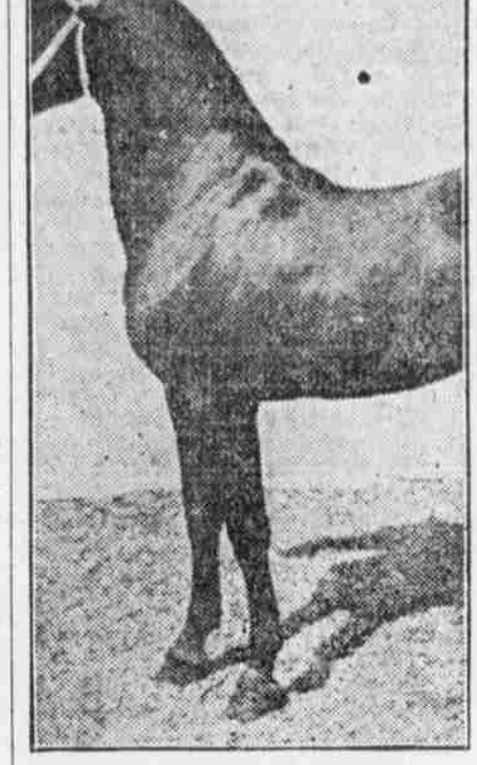
Shoulders Lacking In Depth and in Good Seat for a Collar.

Selection of a horse must be based primarily on a thorough, systematic examination; the examination should be based on a clear knowledge of desirable and undesirable qualities. Not only the presence of unsoundness but also the condition or seriousness of the unsoundness should be noted. Temporary unfitness should be distinguished from permanent unsoundness,