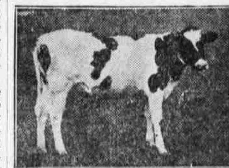
Healthy, Vigorous Calf.

A grain ration of equal parts corn, oats and bran, with a small quantity of oil meal, should be provided for the calf. Even when only a few weeks old a calf will begin to eat grain, and nibble at hay. It is best to feed cracked corn first and later shelled corn. Whole oats are better than ground oats for the young calf. Clover