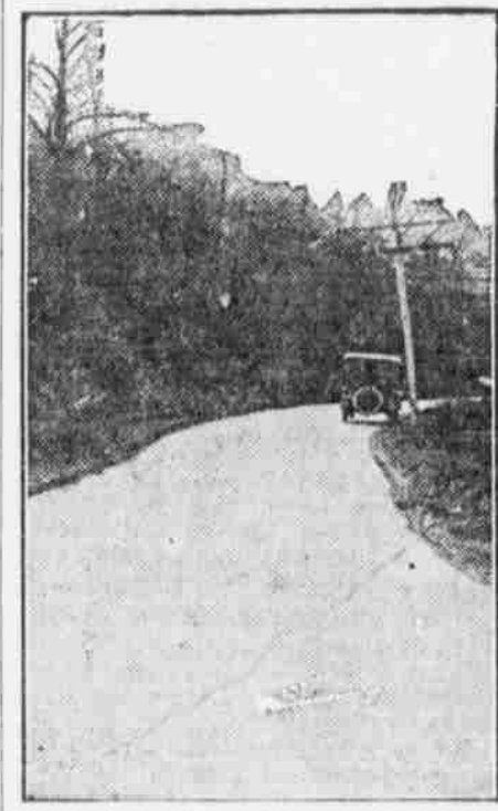
Good Road Near Asheville, N. C.

mud is in such condition as to stick to the drag.