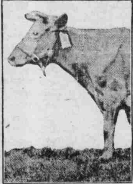
English Prize Guernsey.

Heretofore the difference between the percentage of butterfat in Jersey cows' milk and that of Holstein's has been often emphasized. Only recently has the fact been known that there is considerable difference in protein.