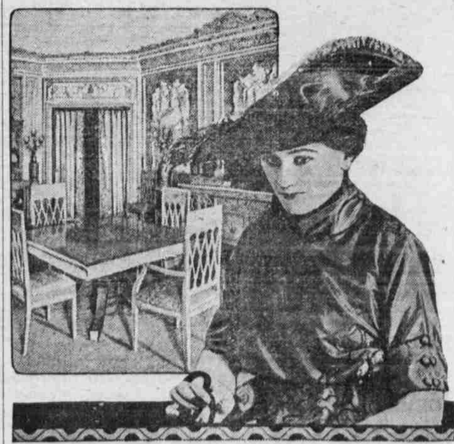
NEWEST IN PEPLUM BLOUSES.

The arm bag, a gorgeous thing of The hat worn with it is a Russian silk, metal braid, laces and bead em-