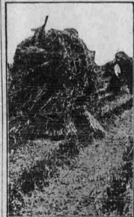
Sudan Grass in Texas.

Experiments made at the Kentucky state station in 1915 produced a crop of eight tons per acre of dry hay in