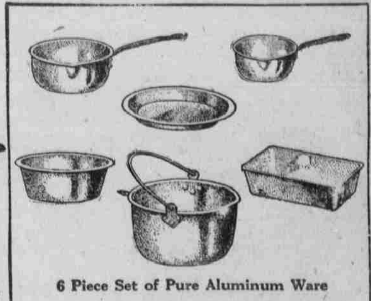
6 Piece Set of Pure Aluminum Ware

See the Range with Cole's Hot Blast fuel-saving combustion. See the Range that heats, cooks and bakes with one fire—no fires to build. See the Range with the perfect baking high oven—no stooping, no backaches. Come and see the many other exclusive features that make Cole's High Oven Range the most satisfactory, the most economical and the greatest time and labor-saving Range ever placed on the market.