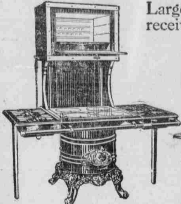
Cole's High Oven Gas-Coal Range

Large crowds intend to visit this Big Sale. In order that you may receive the personal attention of the factory expert we remind our customers and their friends that the Sale starts promptly at 9 a. m. It continues both morning and afternoon. Come early —Remember the date. Everybody cordially welcome.