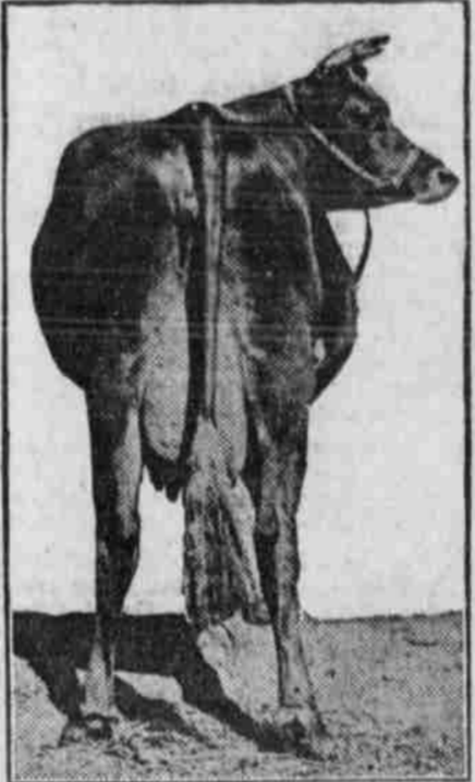
Right Kind to Keep for Milk.

If the milk is sold it will pay to give each cow two quarts of wheat bran morning and evening. Give a forkful of hay or straw to each the first thing in the morning, and after the hay is eaten the bran may be given. This method of feeding keeps the cows in good order, the milk yield is increased and there is less danger from bloat from eating wet clover. Another advantage from feeding bran comes