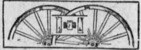
Screw Keeps Tire Secure.

A new method has been devised to stop a buggy or wagon wheel from rattling. Instead of having the blacksmith remove a tire and shrink it on again to compress loose parts, the new process provides an expander bolt for