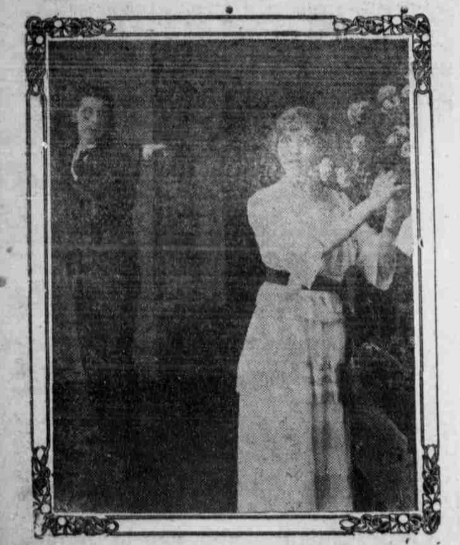
Keith Theatre, Thursday, May 4. "This is not the best you will see of me."