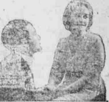
CLARA KIMBALL YOUNG and WILTON LACKAYE in "TRILBY"