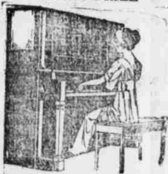
This Beautiful $350 Piano.