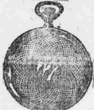
This Lady's or Gentleman's Gold Watch Guaranteed Twenty Years.