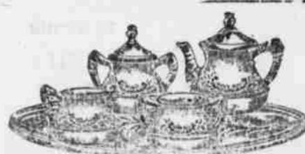
This Beautiful Four Piece Tripple Plate Gold Lined Tea Set.