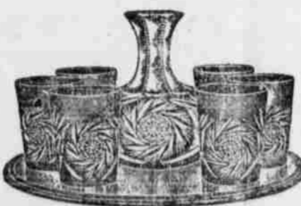
Genuine Cut-Glass Water Set.