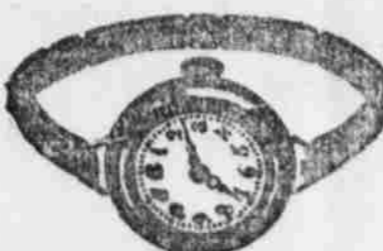
Beautiful Bracelet Watch