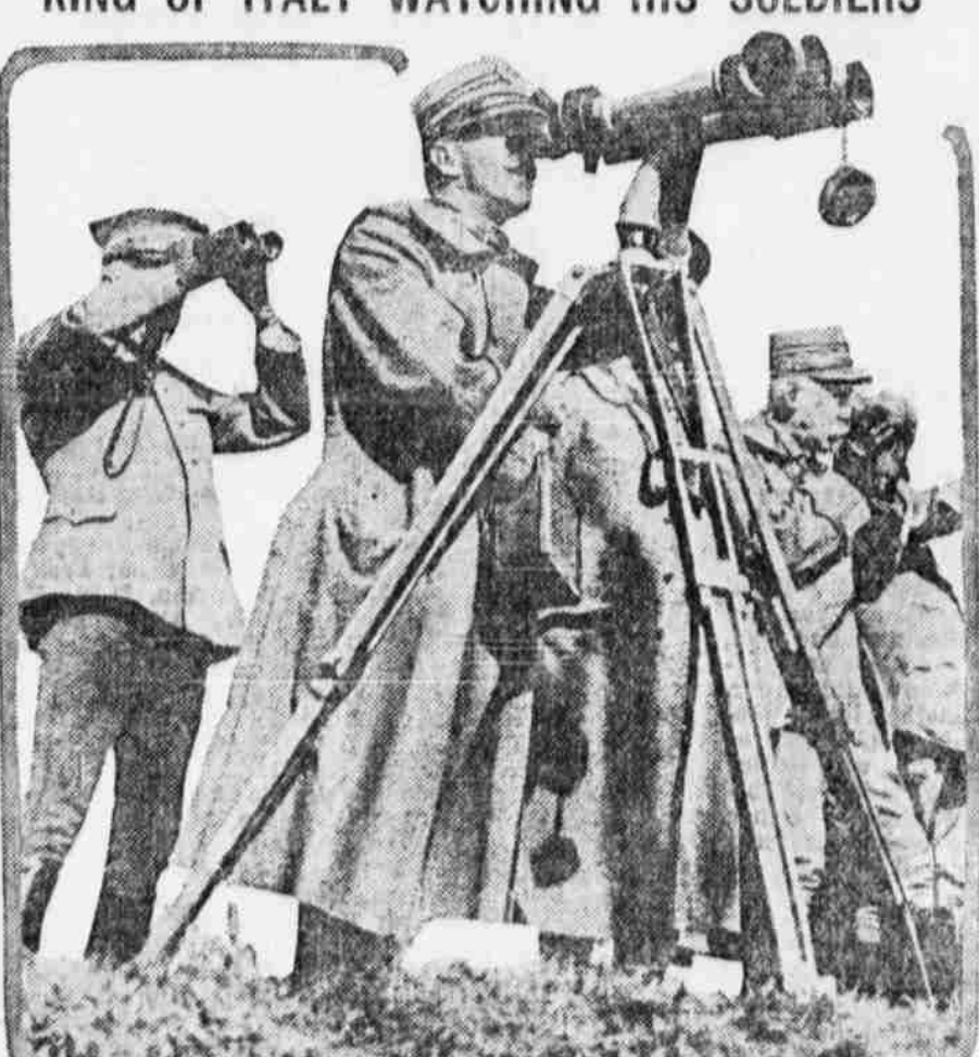
A striking photograph taken on the heights of Cadore while the king of Italy, accompanied by his minister of war and the commander in chief of the Italian armies, was watching the movements of the fighting forces. King Victor Emmanuel has his eyes fixed to the great field glasses.