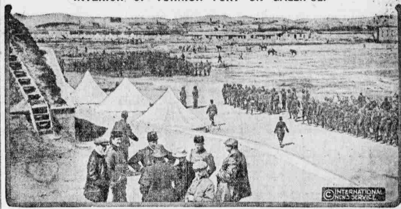
Interior view of Turkish fortifications on the Gallipoli peninsula, with a body of troops about to move to the first-line trenches.