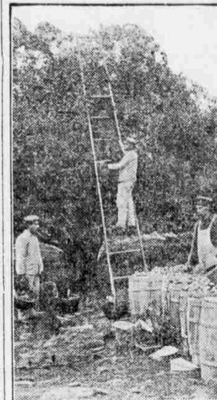
Dumping Apples Into Barrels Without Sorting Gives Middleman Greater Profits, Because He Grades and Sorts.

A great saving may be effected by the scientific handling of fruit of all kinds. In this case "science" means right knowledge and care. The fruit grower cannot always sell direct to the consumer, but he can, by sorting and carefully packing his product, get a much better price when selling to the retail dealer than he can if he follows the old-fashioned methods of dumping everything into boxes, baskets and barrels regardless of size and condition. The shrewd dealer will make the most of the bad condition of the stuff offered him, beating down the grower to the lowest possible price and then add to his profits by the work of a few boys in the basement who are instructed in the art of cleaning and repacking. The grower, himself, could get this added profit if he