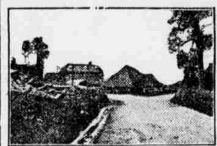
Improved Road in New York.

In spite of these difficulties Mr. Shorer reports that, taking the 60 convicts who were retained at the camp, and comparing them with 51 civilians also working at the camp, the convicts averaged better than the civil-