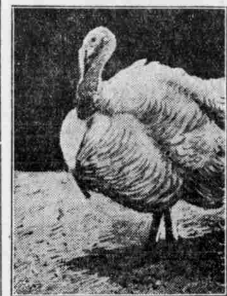
White Holland Turkey.

His reply was that while the constant introduction of new blood into the White Holland would produce a