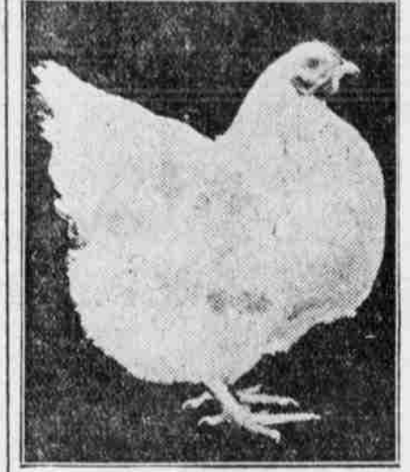
White Wyandotte Hen.