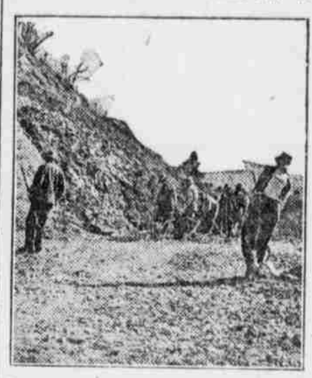
Building a Good Road Through HIII.

We cannot make all the roads rock, macadam or concrete roads, but we