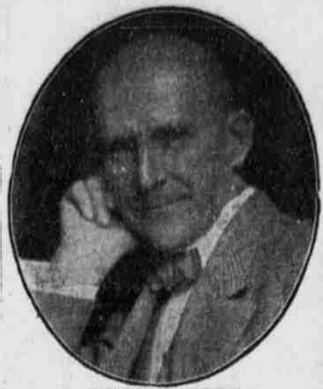
EUGENE V. DEBS.