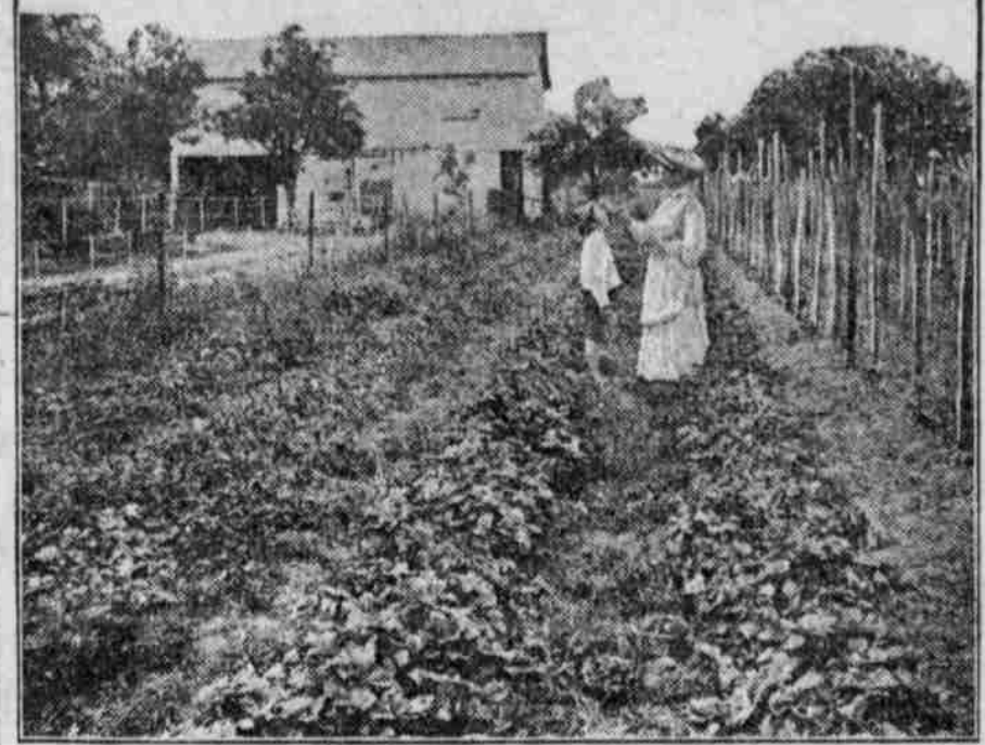
A New Jersey Home Strawberry Patch.

(By ANNA GALIGHER.) The strawberry will stand a good deal of ill treatment, but it will not produce good crops under the above conditions.