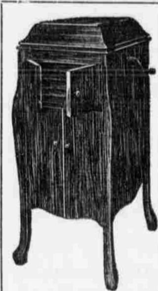
THE VICTROLA STORE

DIAMOND RINGS, EAR RINGS, LOCKETS, GOLD and FILLED BRACELET WATCHES, DIAMOND and PEARL LAVALLIERS, BRACELETS, OPERA GLASSES, UMBRELLAS, TOILET and MANICURE SETS, STERLING SILVER and PLATED SILVER WARE, CUT GLASS, A PRETTY CAMEO RING.