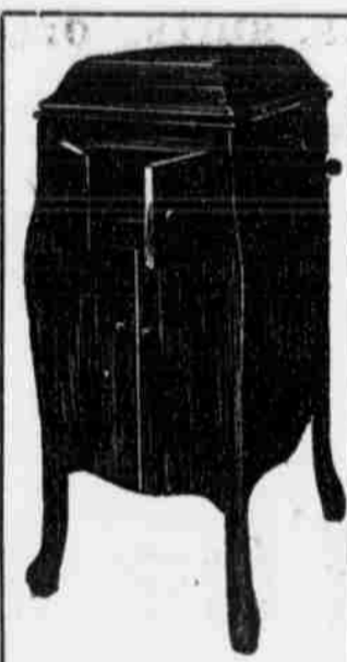
THE VICTROLA STORE

DIAMOND RINGS, EAR RINGS, LOCKETS, GOLD and FILLED BRACELET WATCHES, DIAMOND and PEARL LAVALLIERS, BRACELETS, OPERA GLASSES, UMBRELLAS, TOILET and MANICURE SETS, STERLING SILVER and PLATED SILVER WARE, CUT GLASS, A PRETTY CAMEO RING.