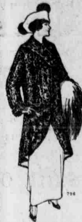
Copyright 1914 The H. Mack Co.

DO not decide on your Fall wrap until you have seen this luxurious, gracefully hanging wrap, which has been reproduced from one of the smartest new Bernard models.