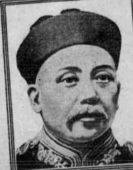
YUAN SHIH KAI

EWS takes a long time to trickle to the United States from central Asia. There are few inhabited places of the whole earth so far away, counting time as distance. With the coast of Asia reached, the traveler must meet many strange perils, endure many torturing modes of conveyance and spend many weary weeks and even months before he reaches the wild empire of the oriental cowboys who once conquered the world, the land of Mongolia.